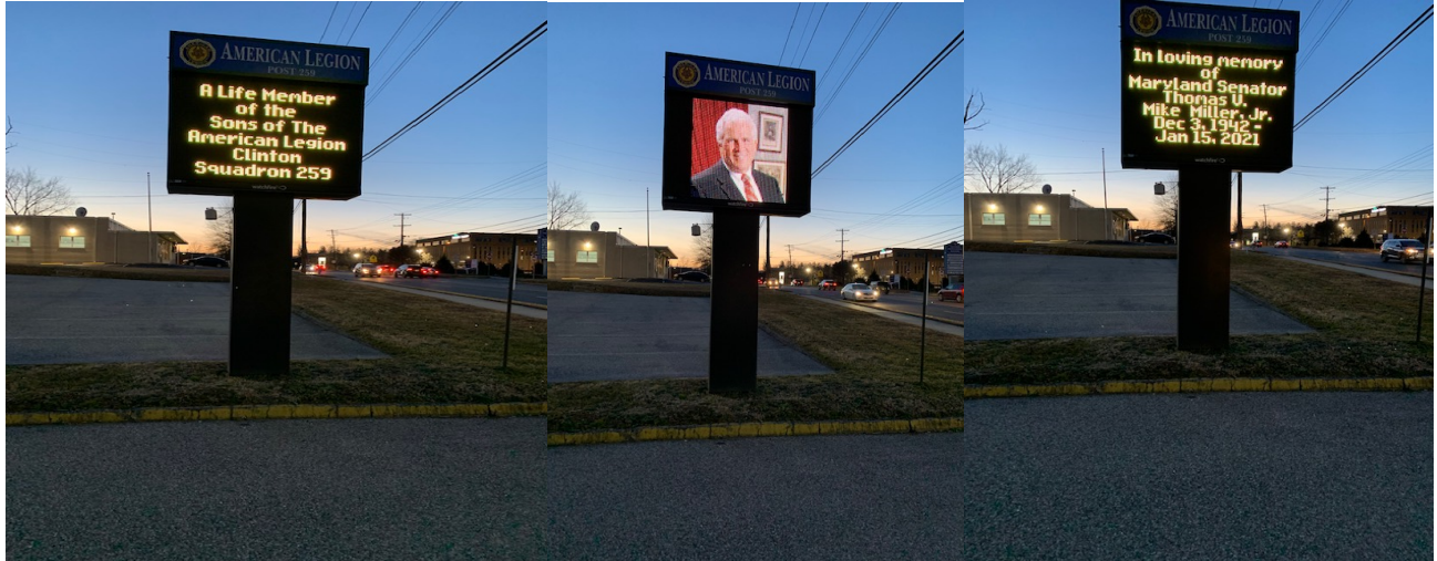
The marquee in front of American Legion Post 259

"A Life Member of the Sons of The American Legion Clinton Squadron 259"