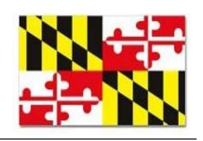
9122 Piscataway Road Clinton, Maryland 20735